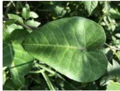
Close-up of leaf (above). Vine overgrowth (right).